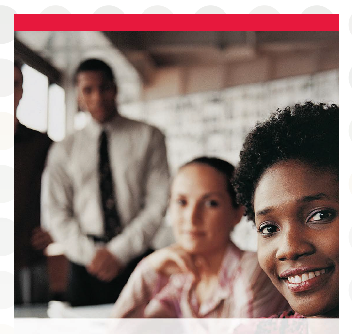
Urban League of Greater Oklahoma City — We're proud to support you